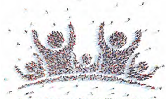
Devon Community Resilience Forum