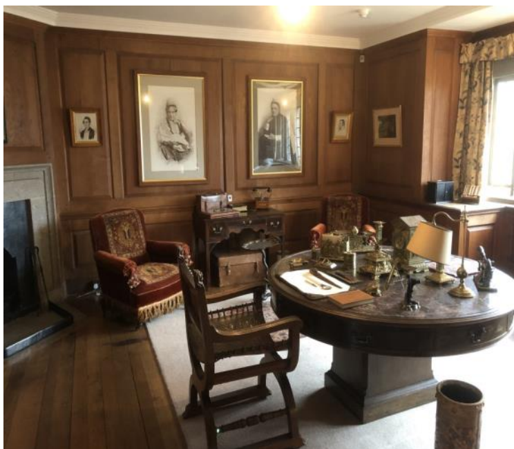
Right. Mr. Drewe's Study which has just been unpacked and re-presented.

Community Involvement Manager, Castle Drogo and Dartmoor 01647 434130, paula.clarke@nationaltrust.org.uk