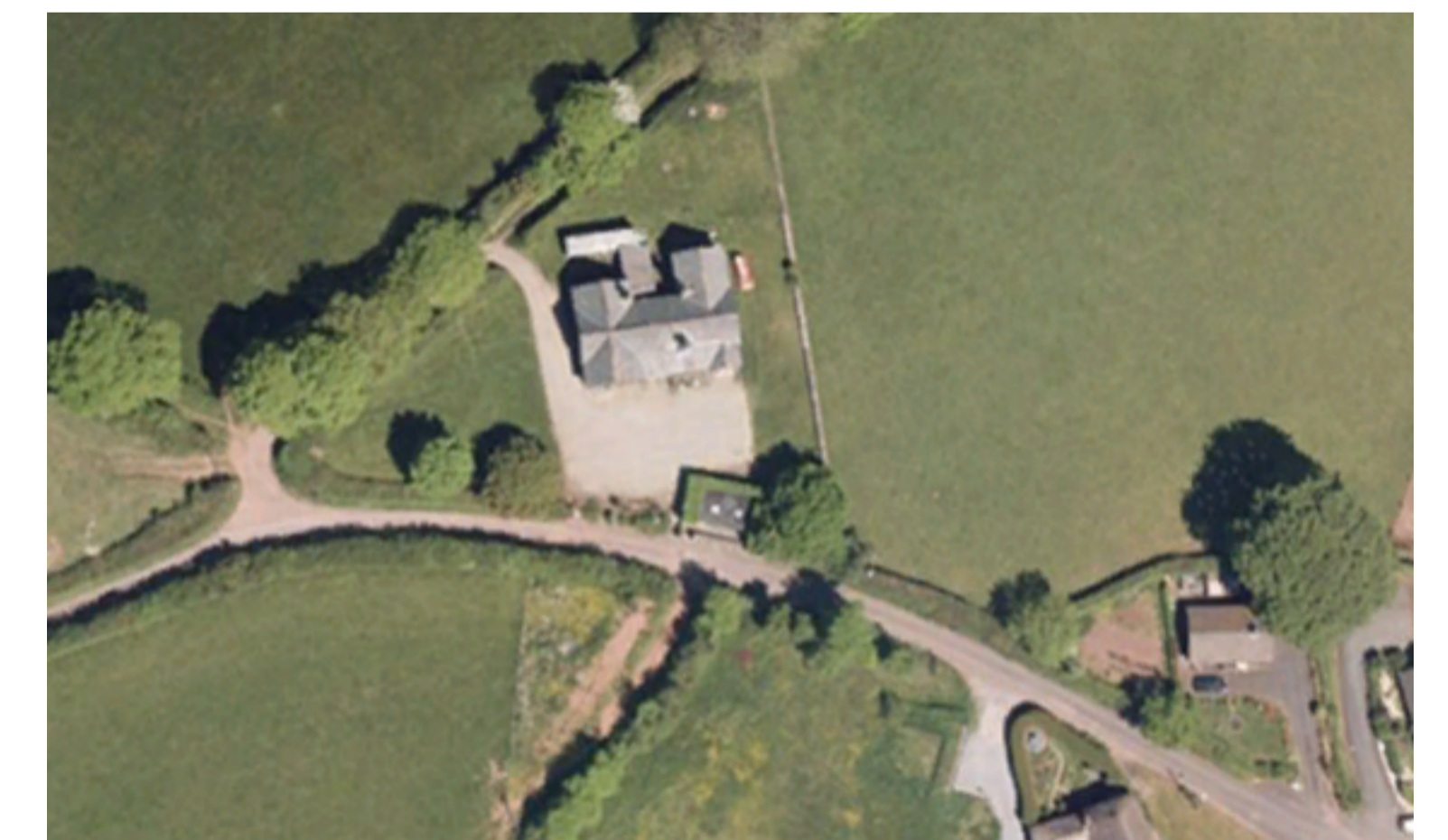
Aerial View Site As Existing